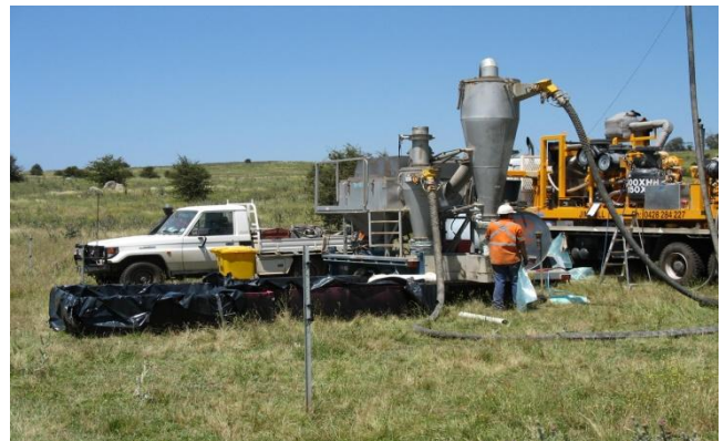
Dust suppressor and sump

The use of a dust suppression system greatly reduces the amount of dust and chips spilled from a conventional cyclone and the amount of airborne dust vented from the cyclone and outside return. An ideal dust suppression unit should have the ability to capture and filter both the sample and outside return material. It should also have a bin to catch dust and chip spillage and any water, which can then be drained into an above ground sump.